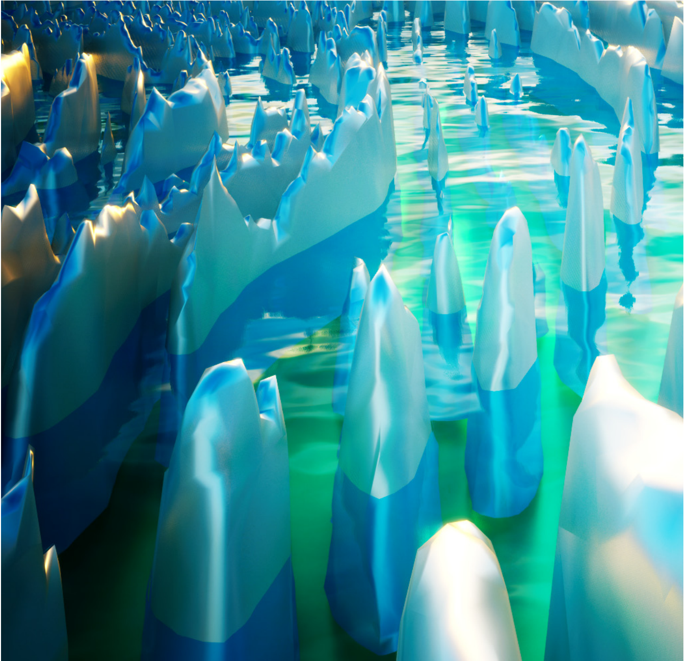
Yeo Chee Kiong (2024), Overprint Land (detail). 3D printed PLA, Video, printed stamps and tempora powders. Dimensions variable.