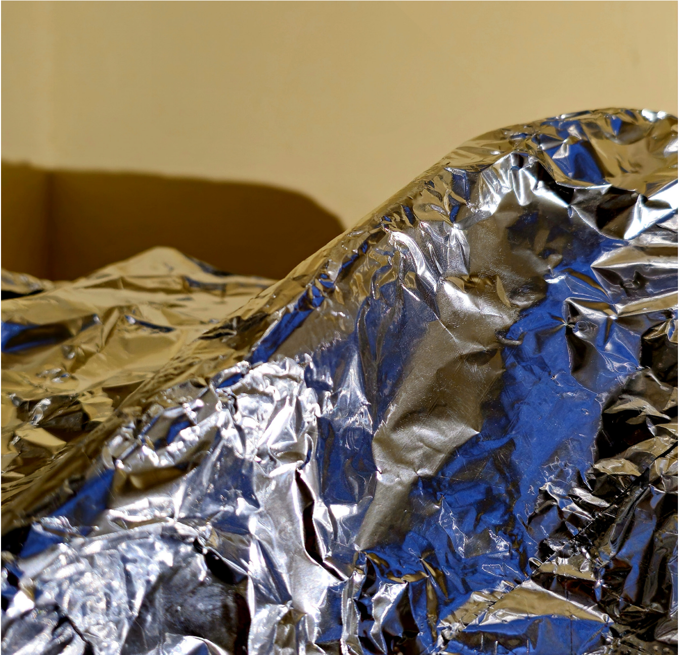
Nhawfal Juma'at (2024), An Inquisition into the Void Century (sculptural installation). Paper mâché, tin foil, woven wire mesh, LED strips. 100 x 70 x 40cm.