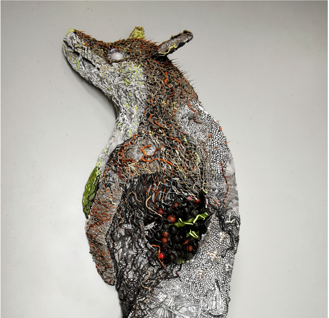
Desmond Mah (2023), The road-kill I saw leaving Koorabup (Denmark, Western Australia) and later in my mind (detail). Acrylic paint, mixed media, print, xuan paper, bamboo. 16 x 86 x 40cm.