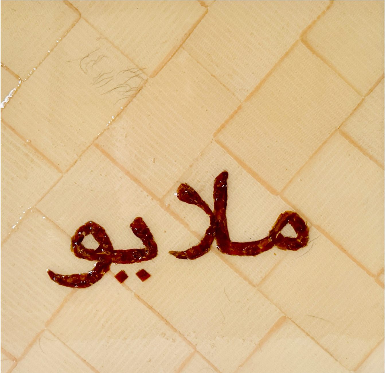
Ezzam Rahman (2024), sesal (detail). Artist's hair, anti-inflammatory plaster, repurposed leather, adhesive, epoxy resin on canvas board. 15 x 10cm x a series of 20 panels.