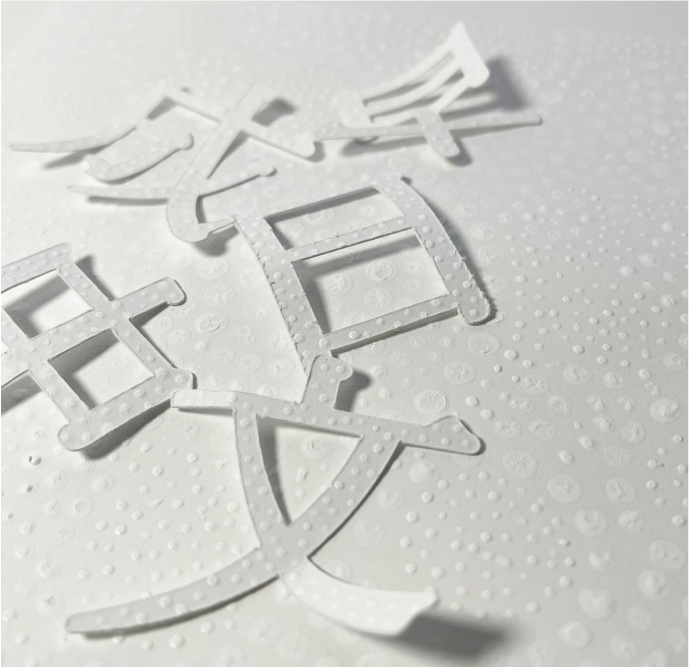
Xin Xiao Chang (2024), A Tapestry of Colonial Threads (detail). Acrylic on 150gsm paper. 24 x 22cm.