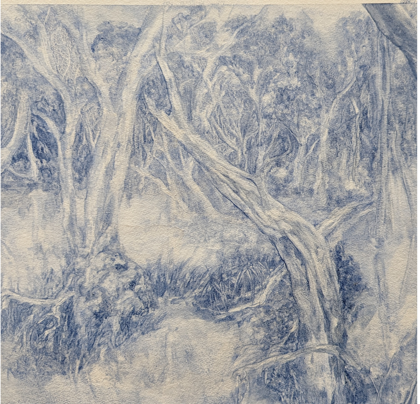
Di Cubitt (2023), Remnants and Ghosts (detail). Oil on paper. 36 x 106cm.